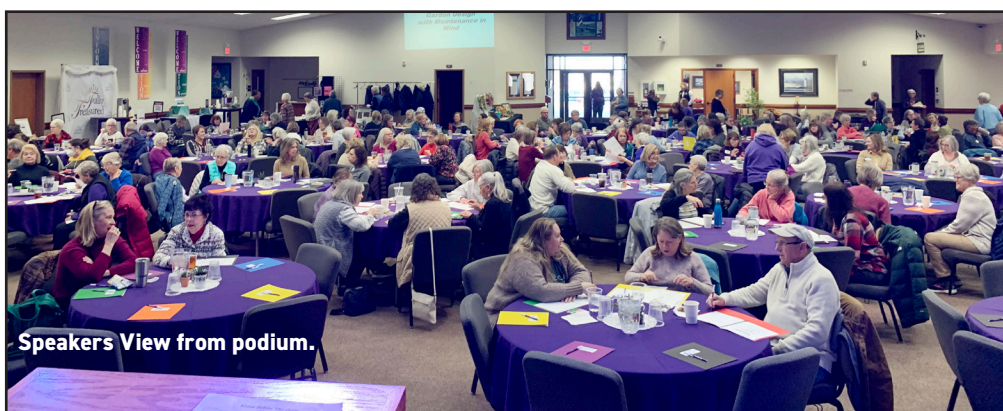
Speakers View from podium.

and the general atmosphere of the crowd. Topping it next year will be a challenge.