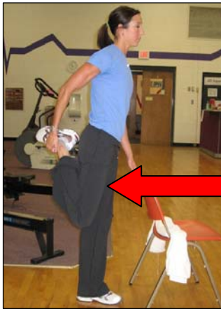
Quadriceps Muscle Stretch