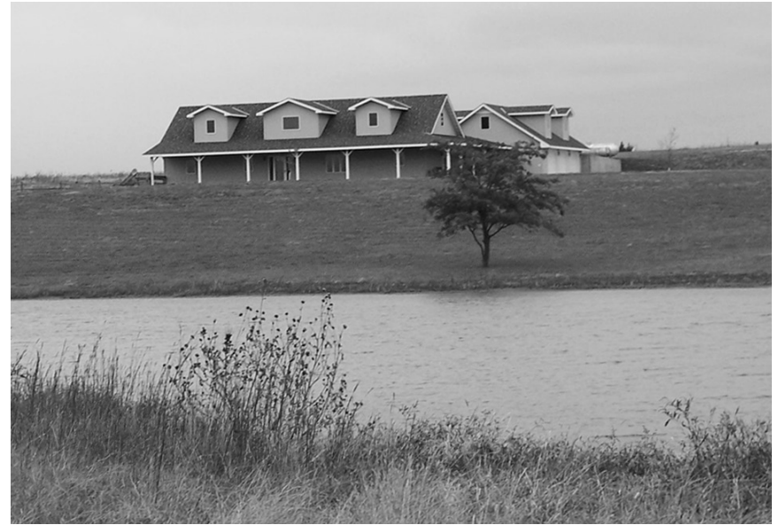
A central Kansas rural home.

Buying an existing country house can be a challenge. It is up to the buyer to identify problems requiring repair or safety improvements before the property is purchased. Disclosure statements are an accepted way to protect a buyer; however,