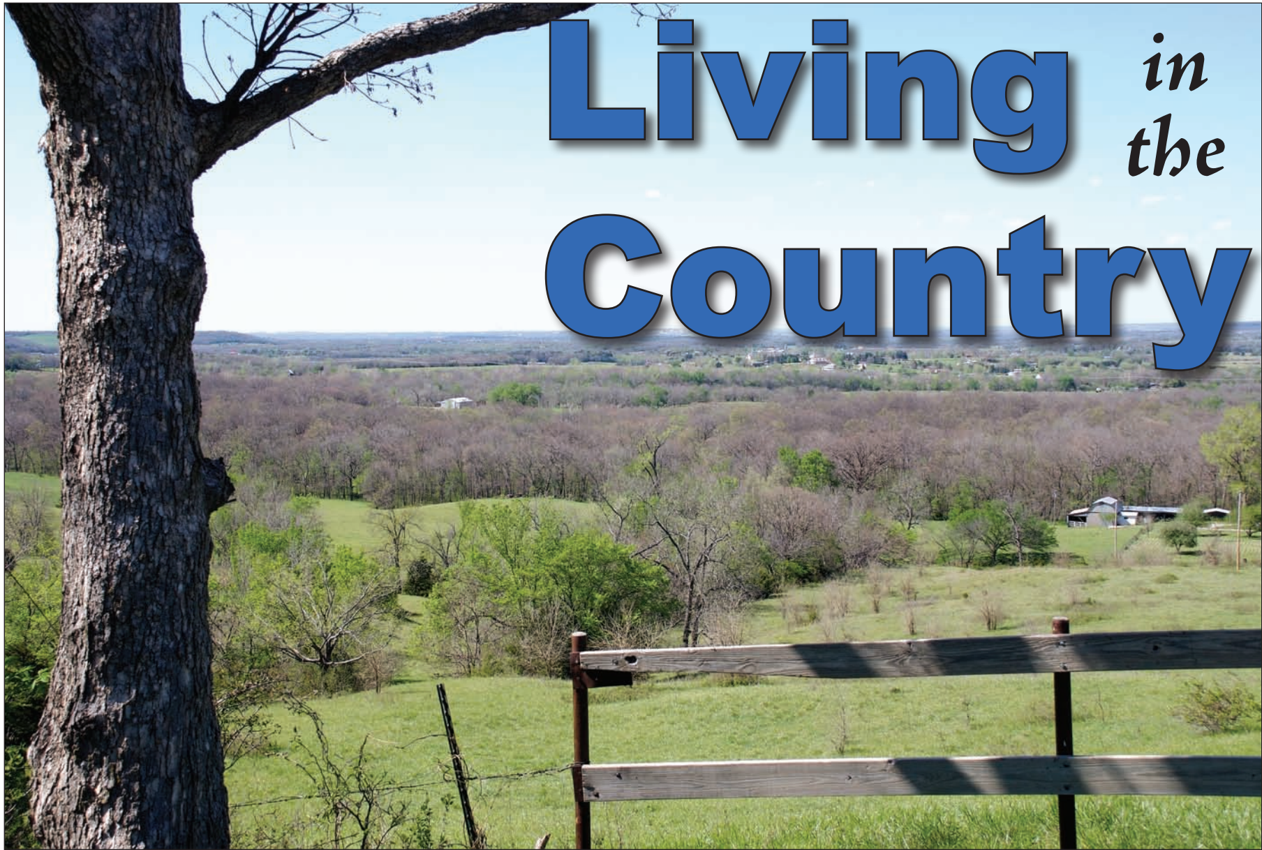
Kansas State University Agricultural Experiment Station and Cooperative Extension Service