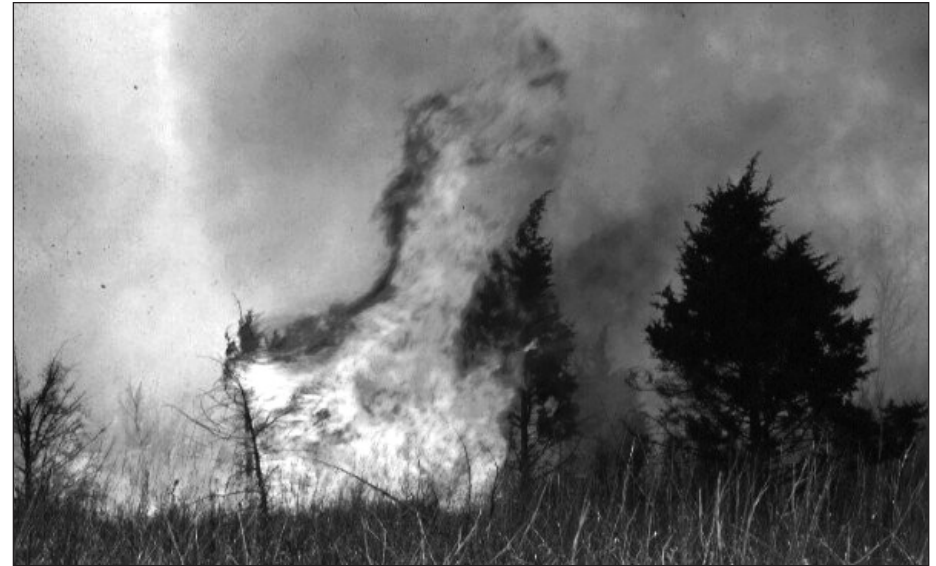
A cedar tree goes up like a torch.

Landscaping. A country setting offers many options for natural landscaping. Look around the property for attractive native plant species that are growing well. Typically in Kansas,