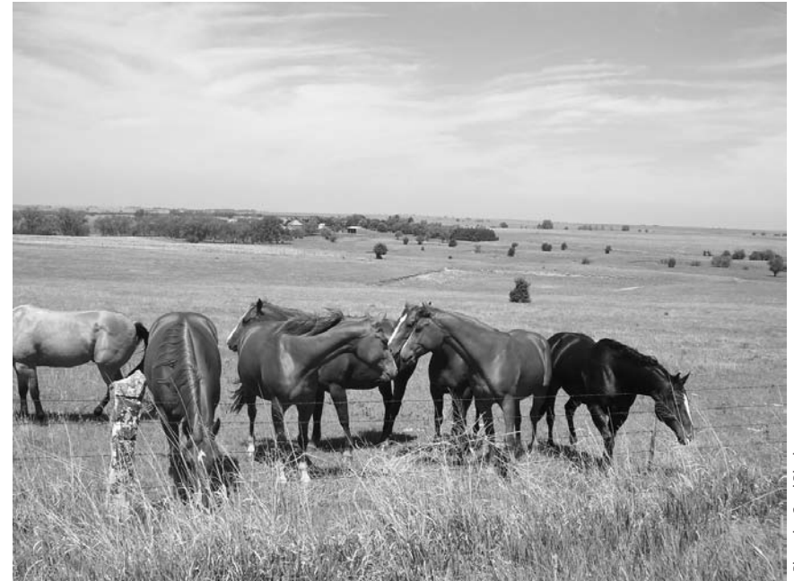
Horses graze in an Ellsworth County pasture.

Some pet owners decide they don't want a pet