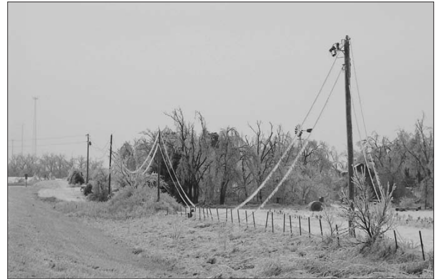
Downed power lines near Riley, Kan., after an ice storm.

Electricity. Very few areas of Kansas are completely without electrical service. However, when electrical service is not near a site, the electric utility or cooperative may require a share of the infrastructure cost (lines and poles) to extend service there. Find out which supplier covers the area and consider all costs before making a decision to purchase the property. In addition to charges for energy consumed, rural homeowners may be charged for hooking up to the system. Electric lines may have to cross property owned by others, meaning easements must be obtained to allow access to the designated property. Make sure easements can be secured before purchasing property.